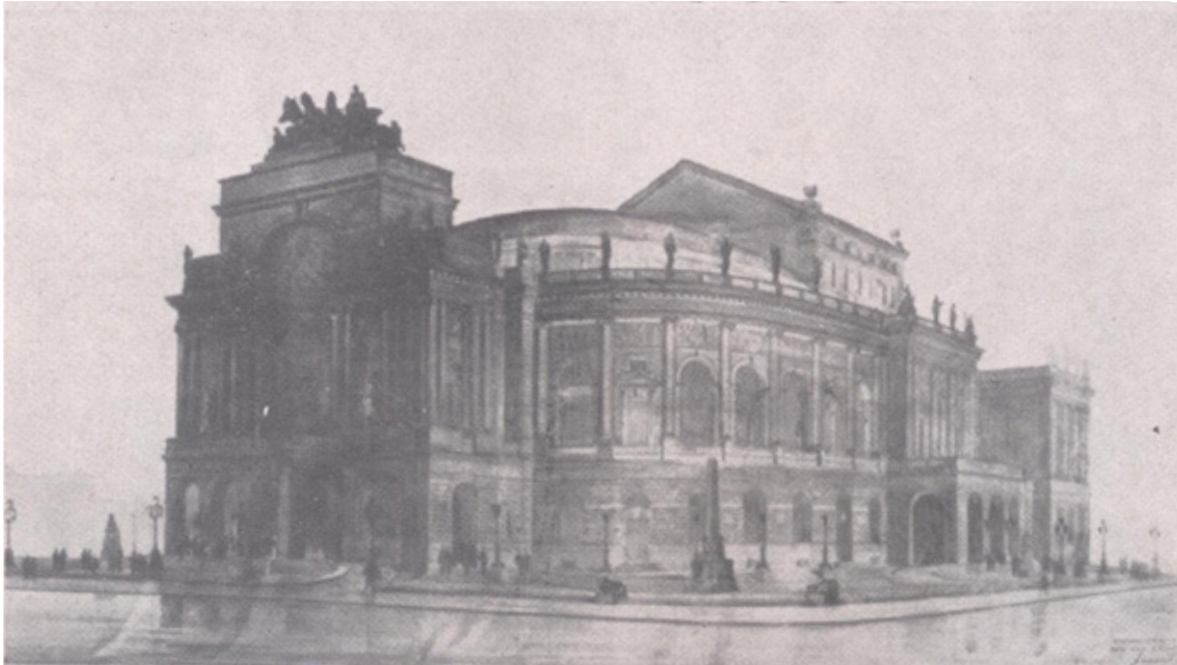
Fig. 1. Papkov's Bachelors project design (Source: Зрнић, Предраг (Ур.)). Публикација Клуба студената архитектуре, 1928.

(КАДИЈЕВИЋ 2000–2001: 220–221). Papkov was assigned the painting part of the design project (ЂУРЂЕВИЋ 2005: 298). It is noted in historiografic research that he also participated in the competition for the Home for the Disabled in Mali Kalemegdan with Milan Zloković, which was rewarded the third place. Papkov's role in this project is unknown (МАНЕВИЋ 2008: 143).