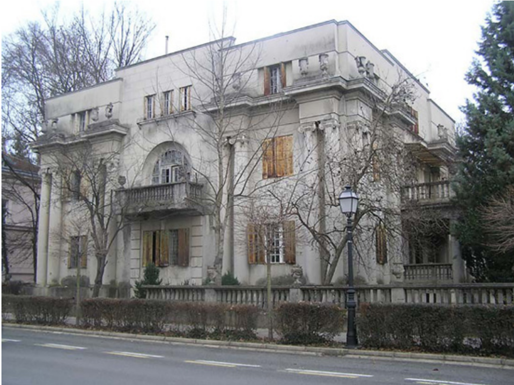
Fig. 2. Villa Savić in Lipik

to build for Milutin Mesarović a few times but one of the buildings that stands out is at 22 Krunska Street dating back to 1935.