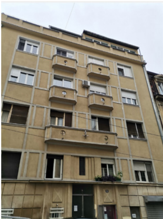
Fig. 5. Alekse Nenadovića, Belgrade

decorative sculpture (Fig. 4), which would have enhanced the vertical in the building, but instead of it, today the building is decorated with stylized vases. 12 An element that is also present on the building today is the decorative line on the top of Balkan Hotel which mimics the roof line of Moskva Hotel. Even though this building was not recognized as a very successful project design, today it is an important part of Terazije square and stands as a testimony to great benefactors Golub and Bosiljka Janić.