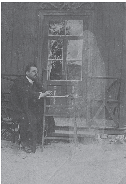
Fig. 3. A peculiar photo of Władysław Reymont exposing his interests. Reymont and the ghost