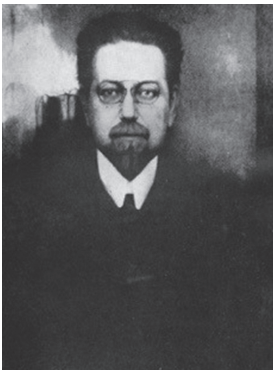
Fig. 2. A portrait of Władysław Reymont by Mieczysław Jakimowicz (1909).

and an artist (1986: 5–10). The first, most popular portrait was painted by Jacek Malczewski – a Young Poland artist (Young Poland was the name of a modernist current in art, literature and music in Poland between 1890 and 1918), known as the father of Polish Symbolism. It presents Reymont as a monumental figure – the author of the epic novel The Peasants . The writer’s surroundings in the painting allude to this work. When Malczewski painted the portrait, Reymont was already among the most renowned novelists in Poland. The second portrait, by Leon Wyczółkowski, shows Reymont as a cheerful and friendly person. The third one (included here) was painted by Mieczysław Jakimowicz, who was the writer’s nephew and friend, and therefore knew him much better than the other artists. Jakimowicz gives Reymont’s face, and especially his eyes, an eerie look; the figure is placed against an obscure, ghostly background. We can imagine that this is how the writer sometimes seemed to those close to him (Kocówna 1986: 5–6). It is on this more mysterious side of Reymont, his interest in Mysticism and Esotericism, and its reflection in his work, that we will focus on.