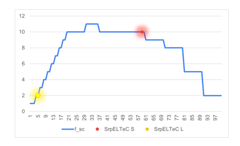
Figure 4. Size category factors: f_{scs} = f(SCS) for short novels, f_{scl} = f(SCL) for long novels. The red dot is the factor value for short novels, the yellow dot is the factor value for long novels for SrpELTeC.