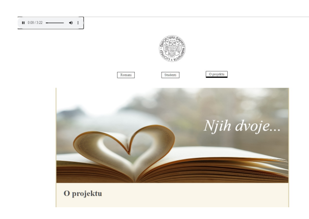
Figure 4. Third page

major problems and within the scheduled deadline (although the Covid-19 pandemic somewhat changed the original work program plan).