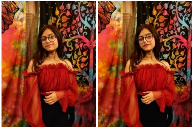
Table 1. Left: photo before modification; right: photo after modification.

These filters and apps can actually do magic to your images. One can apply make-up, lighter the skin tone, thinner the nose, apply fake bigger eye lashes, lipstick, enhance lips, bosoms, bottoms. It has become a popular trend to put up a crystal-clear picture of yourself on social media platforms. The use of these filters and applications has made it easier to shine in images even when you may have just woken up from bed. To illustrate further one of the participants of the survey has actually agreed to let her pictures be used for the study (Table 1). One can clearly make out the differences between the two pictures. The skin is smoother, nose thinner, lips poutier, breasts enhanced. The application used for these changes is Beauty Plus.