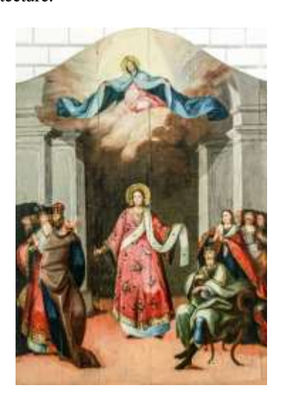
Fig. 5. Protection of the Mother of God (Icon, The Serbian Orthodox Museum of Szentendre, around 1775)

Melodist, dressed in a dark-pink robe with floral applications. On his left are Andrew the Foolfor-Christ, Epiphanius and other priests and monks. On the right side is the emperor sitting in a baroque armchair, and behind him is an escort of imperial dignitaries. The entire presentation is framed with a massive architecture.