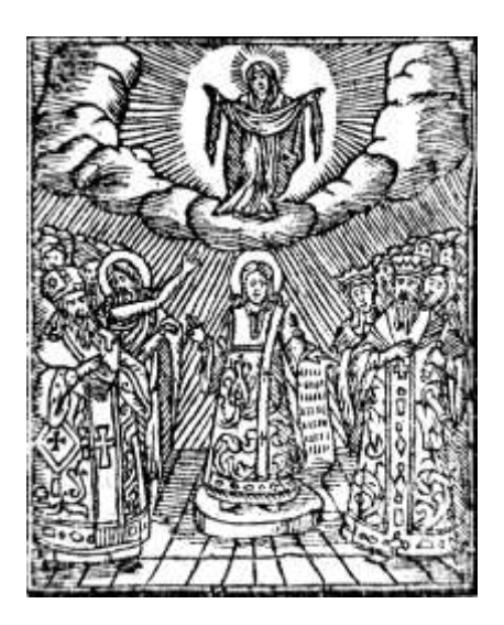
Fig 1. Protection of the Mother of God (Engraved illustration, Molitvoslov, Kiïv, 1753)

Moscow type Protection of the Theotokos, in which the Theotokos, facing frontally, holds the maphorion-omophore in her hands, is the most widespread type of presentation of the Protection in Serbian communities.<sup>25</sup> Such pattern was often used as a graphic presentation in religious Russian-Ukrainian baroque literature, widespread in Serbian communities in the 18th century. The mentioned iconography of baroque templates of the Protection of the Theotokos (Fig. 1) was mostly derived from it.<sup>26</sup>