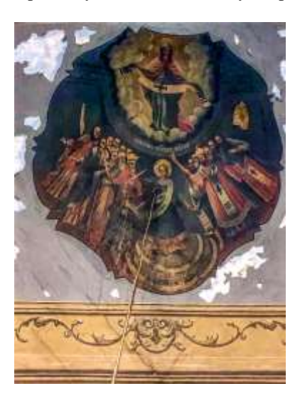
Fig. 4. Protection of the Mother of God (Wall painting in the dome, The Church of Holy Physicians in Futog, around 1780)

arrows, sent together with her cast of saints, who pray together with her.<sup>45</sup> Therefore, everything indicates that the principal designer of the Protection from Futog was familiar with baroque religious literature, and that he precisely followed the literary template.<sup>46</sup>