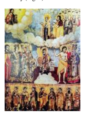
Fig. 7. Protection of the Mother of God (Menaion icon, Sendurd (St. George) Monastery, 1748).

The third type of the Moscow Protection, the so-called "bokovoj perevod", is not recurrent in Serbian baroque painting. The most prominent examples are seen in areas which were outside of mainstream Serbian baroque painting, in Serbian communities distant from the religious center of the Metropolitanate of Karlovci. These rare examples from the 18th century include the icon Protection of the Theotokos (CTъ Покръ Престы Бгрцы), painted by an unknown author, from Senðurð (St. George) Monastery in Banat (1748).<sup>94</sup> The icon is divided into two segments. The upper presents the Protection with the Theotokos together with an escort of saints addressing Christ in the segment of heavens and common protagonists with the central figure of St. Romanos under them. The lower segment includes individual saints celebrated during the month of October (St. Thomas, Sts. Sergius and Bacchus, Holy Apostle Jacob, St. Luke, St. Artemius, St. Demetrius, St. Jacob the brother of Lord, St. Arsenius the Serbian). Therefore, it is a Menaion icon, part of a larger collection of such icons painted for the needs of Senðurð Monastery in mid-18th century (Fig. 7).