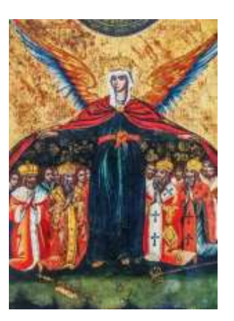
Fig. 6. Protection of the Mother of God (Icon, The Church of Holy Apostles in the Patriarchy of Peć, 1724)

The merge of the western version of the Protection of the Theotokos (Mater Misericordiae) is often combined with the metaphor of Winged Theotokos, therefore, with a developed sophiological symbolism, enhancing the symbolism of patronage, protection, motherly warmth, already offered by the Protection. This type was often entitled "Pokryj nas krovom krylu Tvoeû" ("Покрый нас кровом крылу Твоею"). Such presentations sporadically affected Serbian environments, but have never been widely adopted in Serbian baroque art. Although they took roots in Ukrainian baroque culture, <sup>88</sup> especially in its western part, the reflection of the presented iconography was also familiar in Levantine baroque. Such an example, a Greek work, can be found in the Patriarchy of Peć. <sup>89</sup> The icon of the Protection of the Theotokos (1724) was painted for the iconostasis of the Church of Holy Apostles and represents a high-quality work of Thessalonica masters, very popular in the third and fourth decades of the 17th century during the obvious inflow of Levantine baroque, from the Patriarchy of Peć to the Metropolitanate of Karlovci. <sup>90</sup> The composition style, just like the style of other icons painted for the same iconostasis, indicates clear Italianisms and impact of the painting of Ionian islands, along with the style of painter Panagiotis Doxaras (Fig. 6). <sup>91</sup>