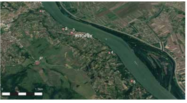
Fig. 1. Reconstructed positions of Celtic sites in Ritopek: 1. Ritopek–Dalekovod; 2. Ritopek–Vodice; 3. Ritopek–Oglavak; 4. Ritopek–Kamenita glavica; 5. Ritopek–Plavinački potok.

used both as domestic living spaces and as a funereal landscape – the earliest graves date to the Early Eneolithic Tiszapolgar culture, as confirmed by the find from the site of Ritopek-Dalekovod, which is most certainly a grave good (Тодоровић 1967). Middle and Late Bronze Age graves are most numerous among the 16 graves discovered during the only extensive archaeological excavation carried out at the site of Ritopek-Dalekovod, during 1960 (Тодоровић 1967). Finds from cremation grave 12, i.e., two iron spears,