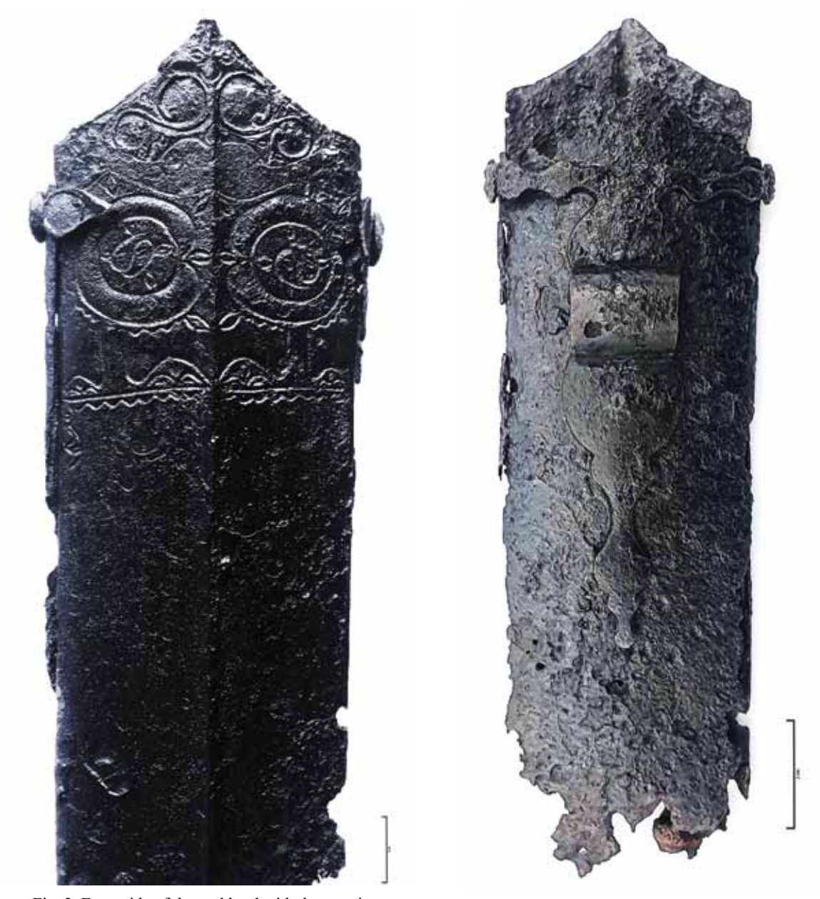
Fig. 3. Front side of the scabbard with the remains of the reinforcement clamp.

- The first element of the decoration, although only partly preserved, is the iron clamp that held together and reinforced the two plates of the scabbard. The sword was partly pulled out of the scabbard and the front plate was also pulled out of its original position. The front plate is currently positioned almost a centimetre higher than initially