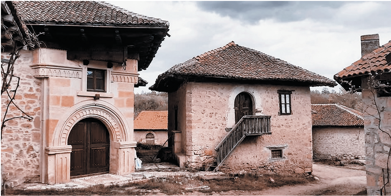
Fig. 10 Negotin wine cellars