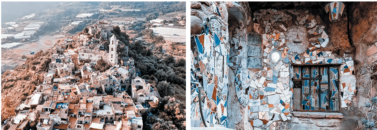
Fig. 3 Bussana Vecchia (Left https://as2.ftcdn.net/v2/jpg/02/81/91/71/1000_F_281917129_MJIW1uz3r04THN9jse2ffosBLI4IamCm.jpg ; right https://as1.ftcdn.net/v2/jpg/01/68/92/32/1000_F_168923243_g11f8z1HI8FHbB5GxkRCuSFnZ3KwOQdv.jpg accessed May 2023)