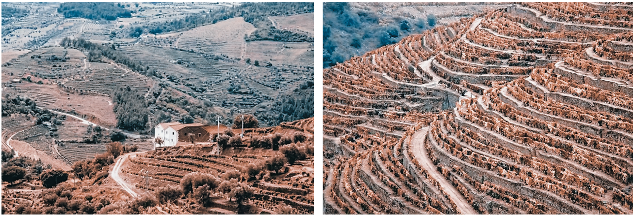
Fig. 8 Alto Douro