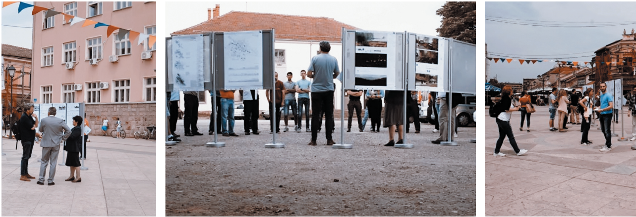
Fig. 7 Students' exhibition (Left Z. Đukanović, A.B. Cecchini (eds.), Negotinske pivnice – Participativni urbani dizajn , 179; middle Ibid. 180; right Ibid. 182)