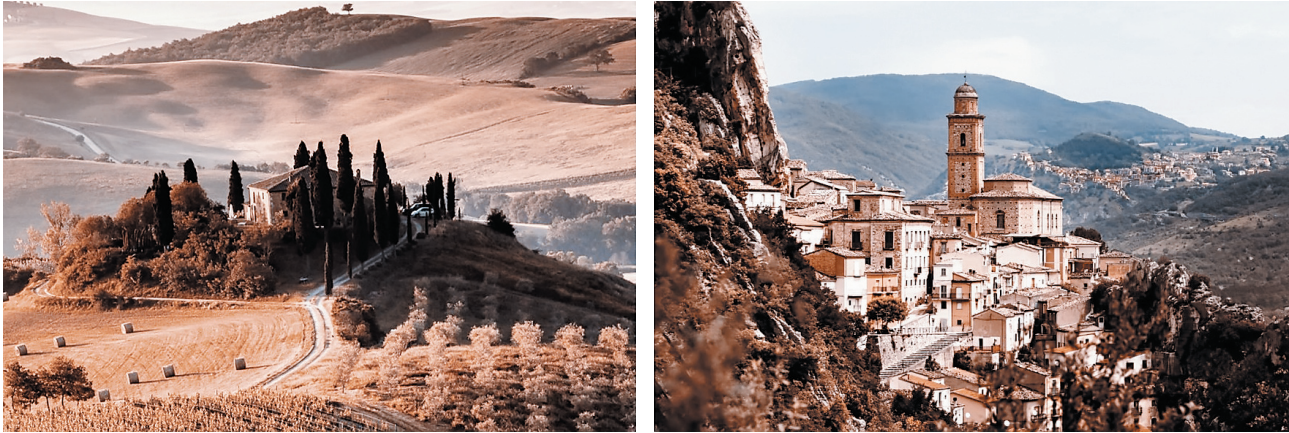
Fig. 9 Italy wine regions

(Left https://cdn.kimkim.com/files/a/images/528c8fb7cd791cb367904f653f79e744130e673f/big-9980a9e2c4e20eef3c6af00fb5eb4001.jpg ; right https://www.expedia.co.in/Villa-Santa-Maria.dx3000025816?gallery-dialog=gallery-open accessed May 2023)