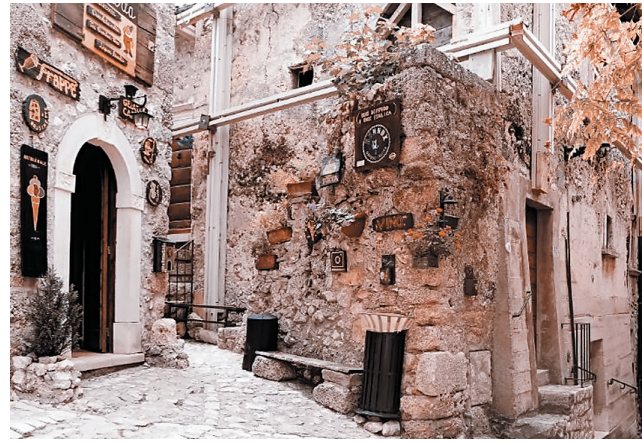
Fig. 4 Santo Stefano di Sessanio