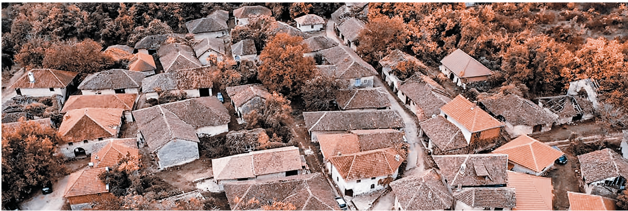
Fig. 5 Negotin wine cellars and their surroundings